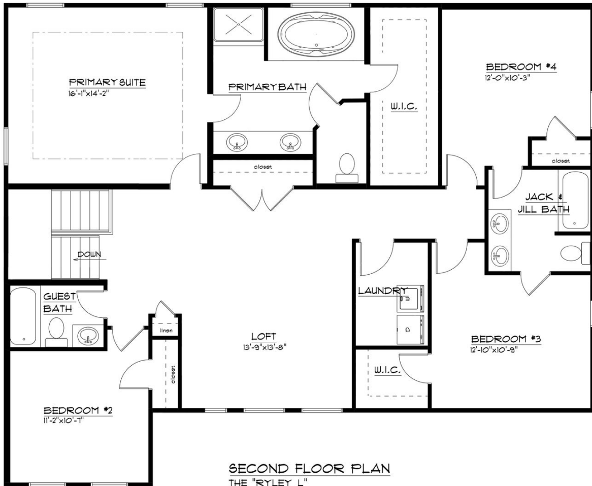
SECOND FLOOR PLAN THE "RILEY L" 4/4/2024